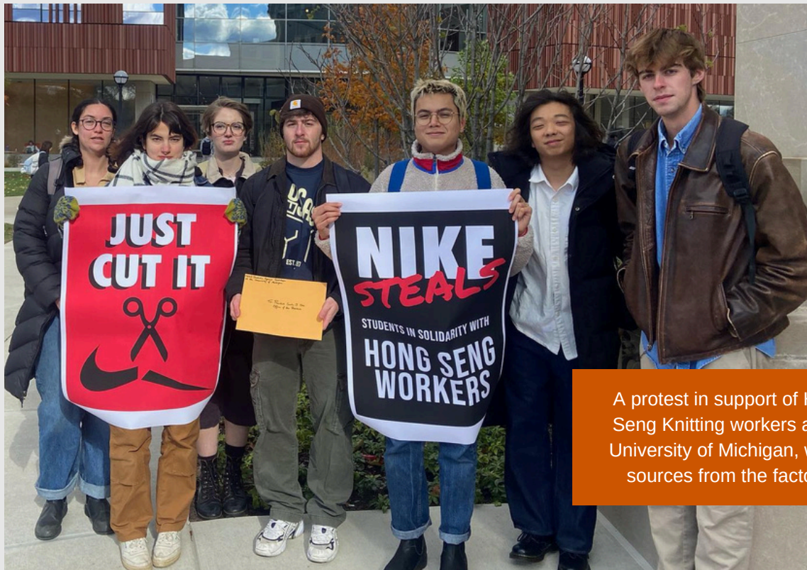
A protest in support of Hong Seng Knitting workers at the University of Michigan, which sources from the factory.