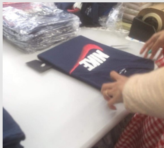
Photos from Violet Apparel taken by workers before the factory closed down, showing Nike products.