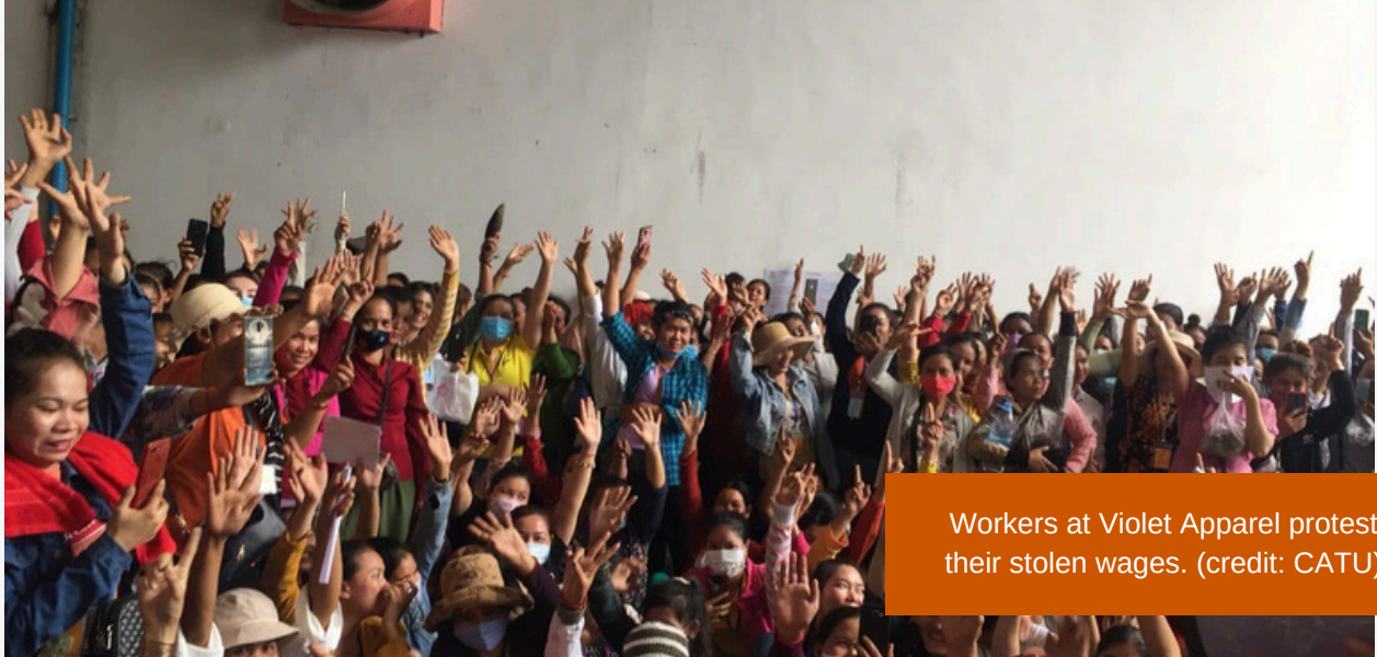
Workers at Violet Apparel protest their stolen wages.

Sportswear giant Nike has been under fire for the working conditions in their factories since the 1990s. They have been a leader in outsourcing: when they got their start in footwear in the '60s, just four percent of their product was manufactured outside the United States. That's now 98%. And if the goal was to put the consequences of their low-bar purchasing practices out of sight and out of mind, it might have worked for a few years. But garment workers and activists around the world are onto their tricks.