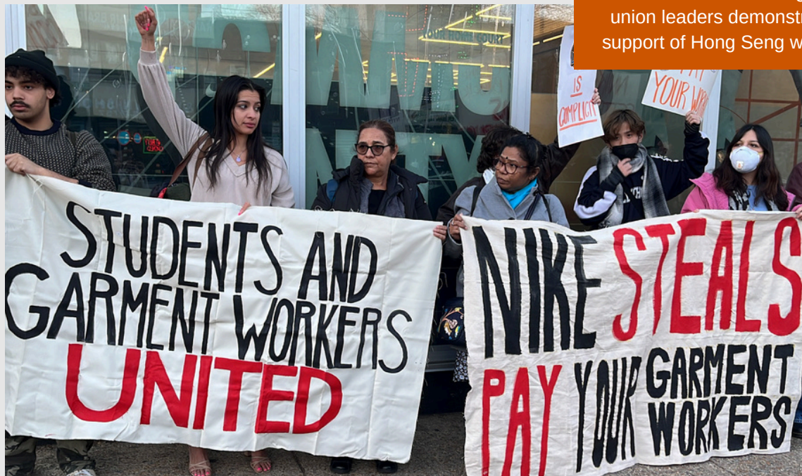
American students and garment union leaders demonstrate in support of Hong Seng workers.

The example of Thai Garment Export shows that Nike is an outlier in the industry. Instead of following clear legal precedent and the example of other brands in the industry, Nike chose to hire consultant after consultant to rubber stamp their supplier's schemes - in violation of their MOU with some of their most significant buyers, universities.