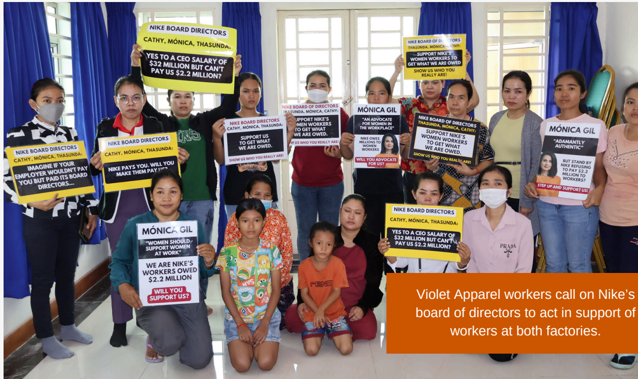
Violet Apparel workers call on Nike's board of directors to act in support of workers at both factories.

Both these case studies make clear that Nike is willing to lie and twist the truth repeatedly. There's just one truth that runs through all these cases: Nike, and the cash-rich factory groups that make its products, put profits and commercial success above everything else, including their responsibility to workers and to international human rights norms.