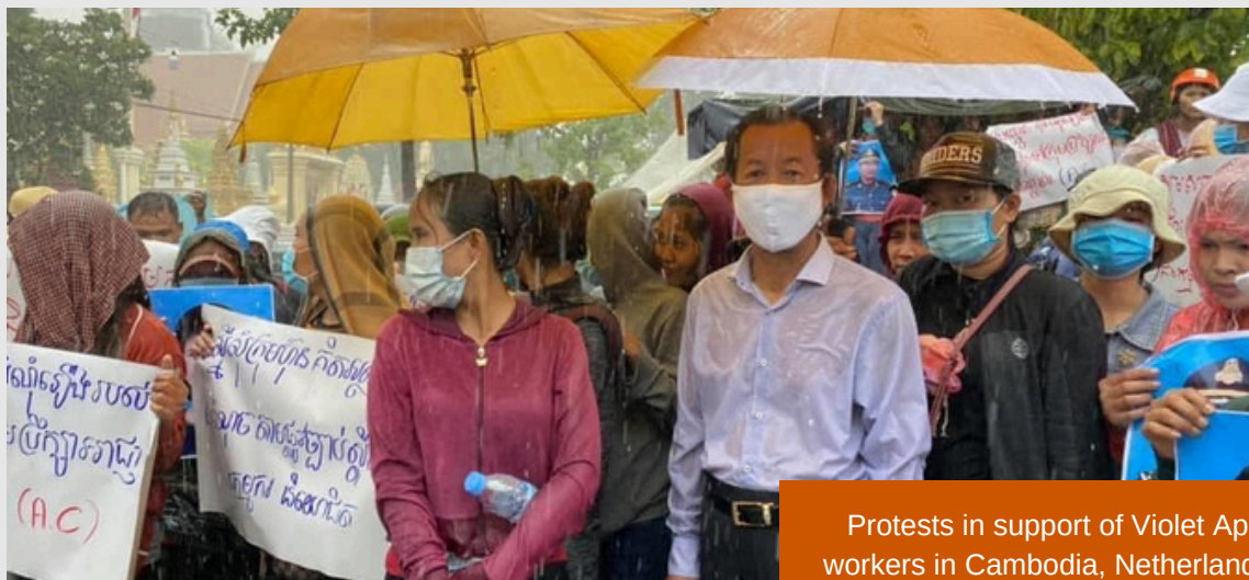
Protests in support of Violet Apparel workers in Cambodia, Netherlands, and Croatia.

Nike continues to evade responsibility for the consequences of their purchasing practices. The Violet Apparel case showcases the advantages they gain through doing business with long chains of subcontractors in a country which has gained attention for failing to protect workers' human rights. But through all the twists and turns, two things are clear: Nike Lies, and 1,284 Cambodian garment workers are still waiting to get paid four years later.