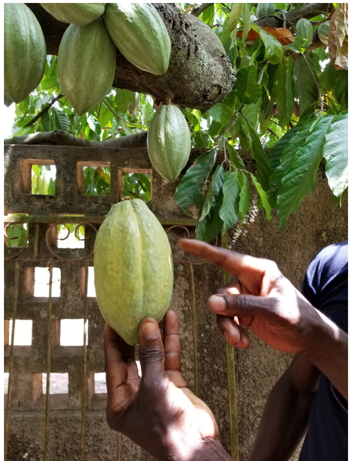
Cocoa pod ready to harvest.

We find a central action that that will help address all of these obstacles in a real way, and we make one primary recommendation: companies should increase the price they pay for cocoa, industry-wide. This price increase can, and should, be part of a broader “sustainability” effort, but cannot be excluded any longer. The government has a critical role to play, too, but companies must not wait for governments in both producing and buying countries to act in order to fulfill their own responsibilities. Companies have benefitted for years from an unsustainably low price, and it is time for them to take responsibility for their role in creating the conditions that have led to extreme poverty, deforestation, child labor and trafficking across the sector. Without meaningfully addressing this root cause, their CSR activities are little more than window dressing.