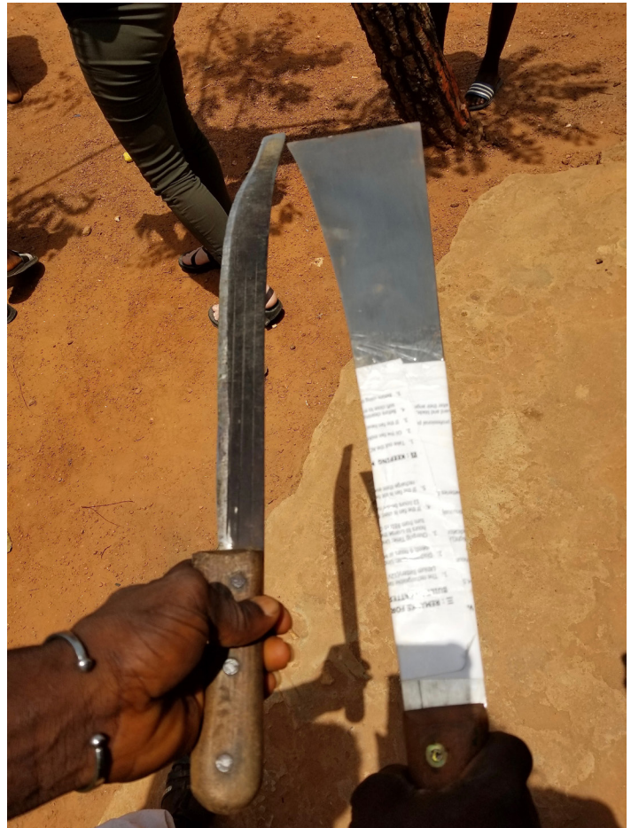
The labor-intensive nature of many of the cocoa-growing activities can be seen in how they wear down machetes, as displayed above. When it was new, the machete on the left was identical to the one on the right.

Workers who do not operate in a sharecropping agreement