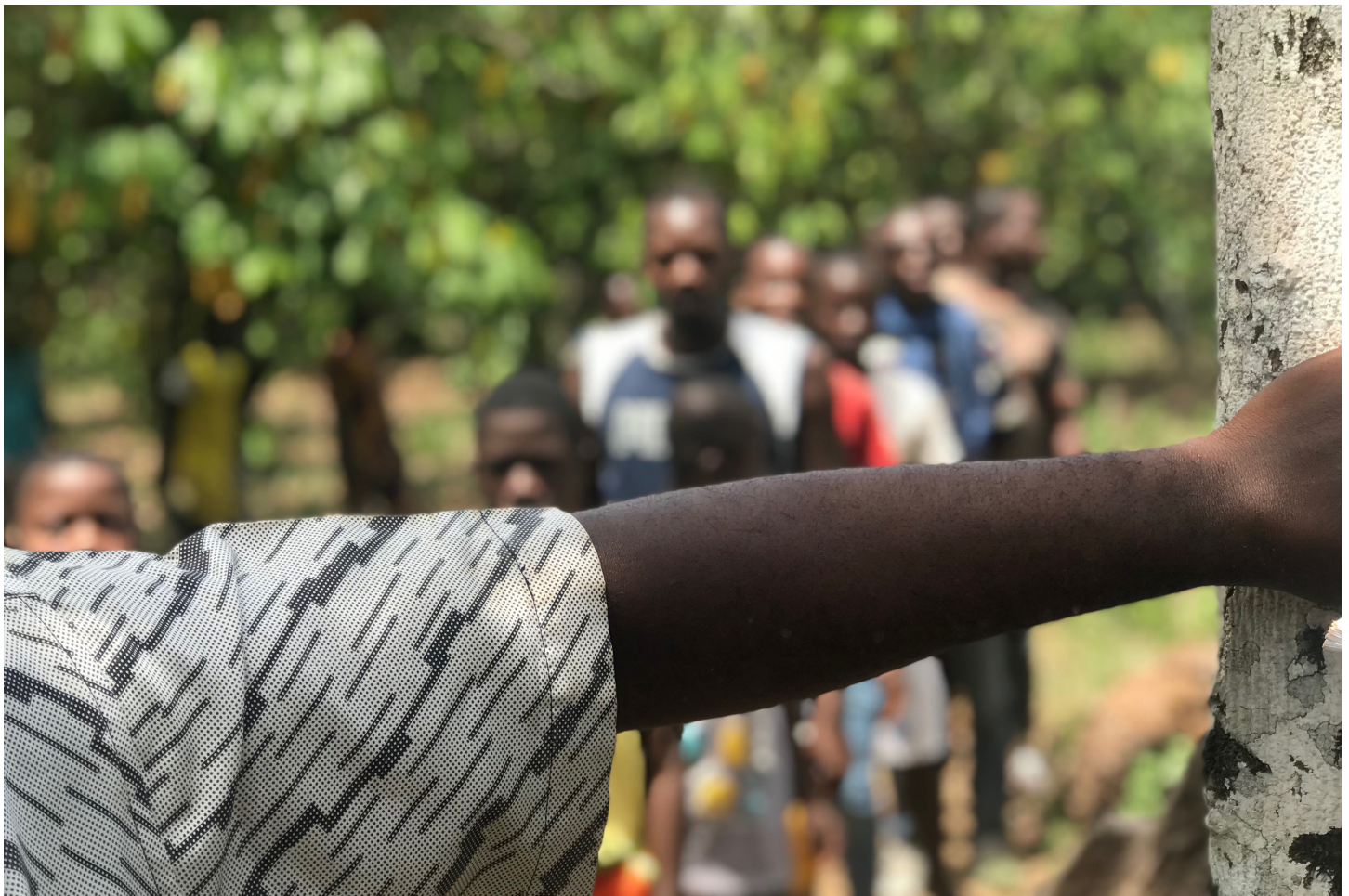
On a visit to a cocoa plantation in one village, farmers told CAL how their parents were able to put them through school with the income from cocoa, but with the current price it is much more difficult.

Most CSR initiatives use broad language when stating their commitments to “benefit” or “improve the lives of” large numbers of farmers. Cocoa Action has an ambition to reach 300,000 farmers by 2020. 138 Cargill started its Cocoa Promise program in 2012, and in its updated plan, seeks to have 1,000,000 farmers “benefiting” from the services by 2030. 139 Barry Callebaut’s Forever Chocolate plan has a goal to “lift more than 500,000 cocoa farmers out of poverty” by 2025. 140 The opacity of the language gives space for overly broad interpretations of how and to what extent people are actually benefitting. What concrete and tangible changes will result from these initiatives, and whose perspectives are taken into account when deciding if they are successful? Is success measured on farmers who actually participate, or simply those who have access? The companies have been making this type of vague promise for two decades, and despite the attractive language, their actual programs either impact very small numbers, or have intangible benefits.