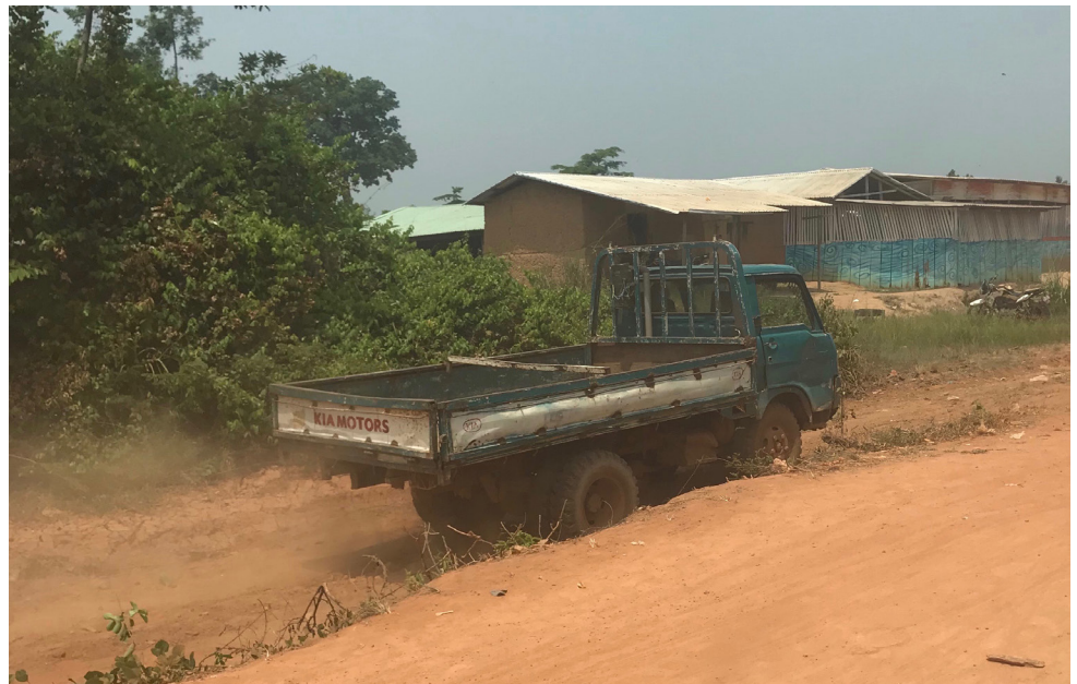
Truck used to transport cocoa. Many of the trucks are not labeled, raising transparency concerns. This truck was entering a classified forest, likely to collect cocoa harvest from the illegal farms within.

Profit distribution along the cocoa supply chain is indicative of the significant bargaining power held by the brands and exporters, and the very little power held by farmers. The vast majority of cocoa farms are small and family-run. While farming unions do exist, farmers are largely unorganized. Other collectively owned or managed enterprises such as cooperatives, which would give farmers greater bargaining power, represent a very small number of farms.