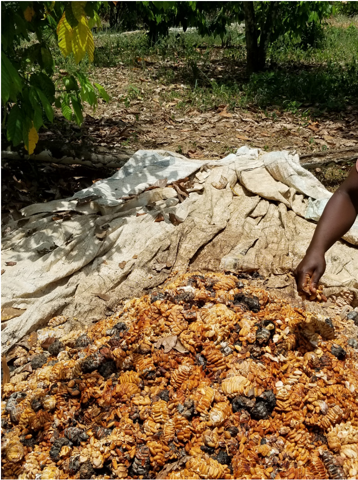
The fermentation process for cocoa beans takes approximately 6 days.

the Caribbean” through the Cadbury Cocoa Partnership. 100 This likely represents the amount paid for certified cocoa, rather than just the premium paid or the cost of “sustainability” programs. In 2017, Mars announced it would invest $1 billion between 2017 and 2020 in sustainability initiatives, and Hershey’s announced a $500,000 investment for the same period. 101 Mars’ billion dollar investment “will come in the form of business expenses, not corporate social responsibility or philanthropic programs,” even though it has been billed as a “pivot toward sustainability.” 102