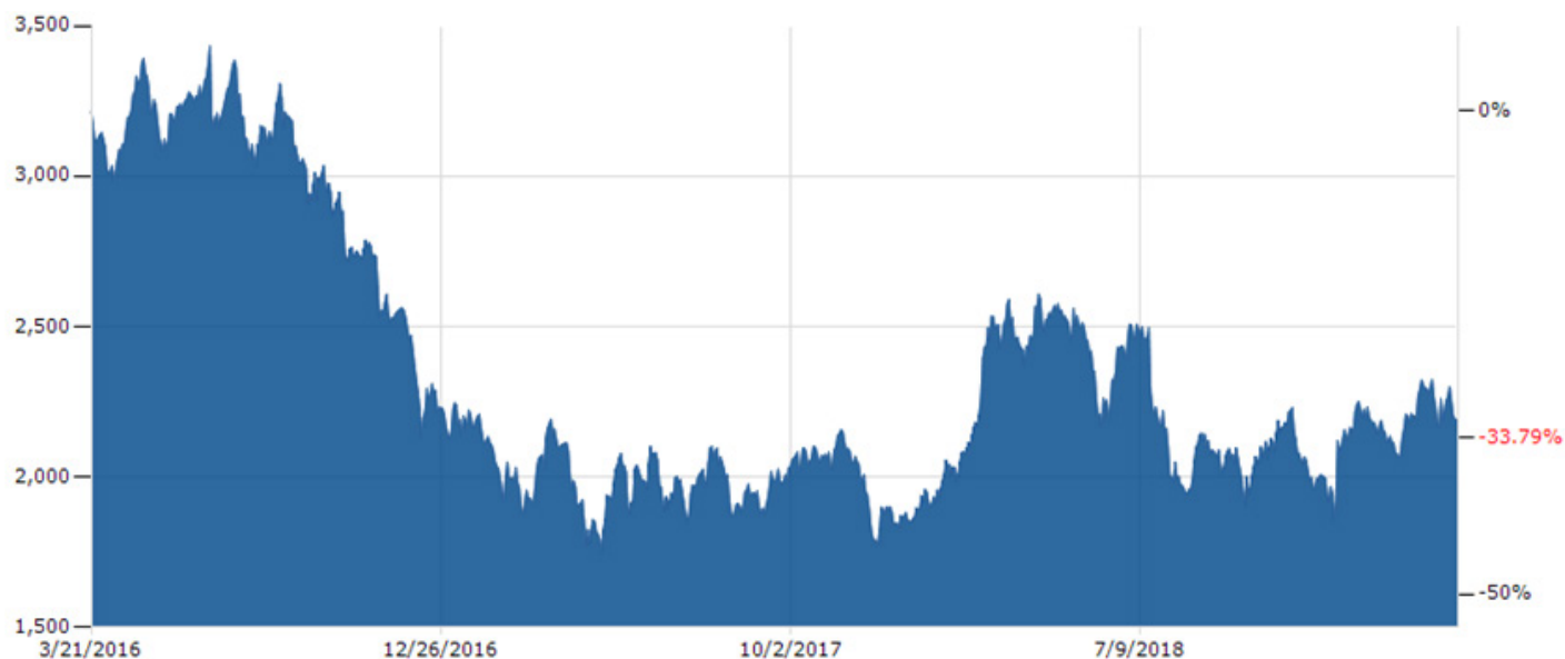
Figure 1: Cocoa Prices Mar. 21, 2016-Mar. 21, 2019. Prices are USD per tonne.